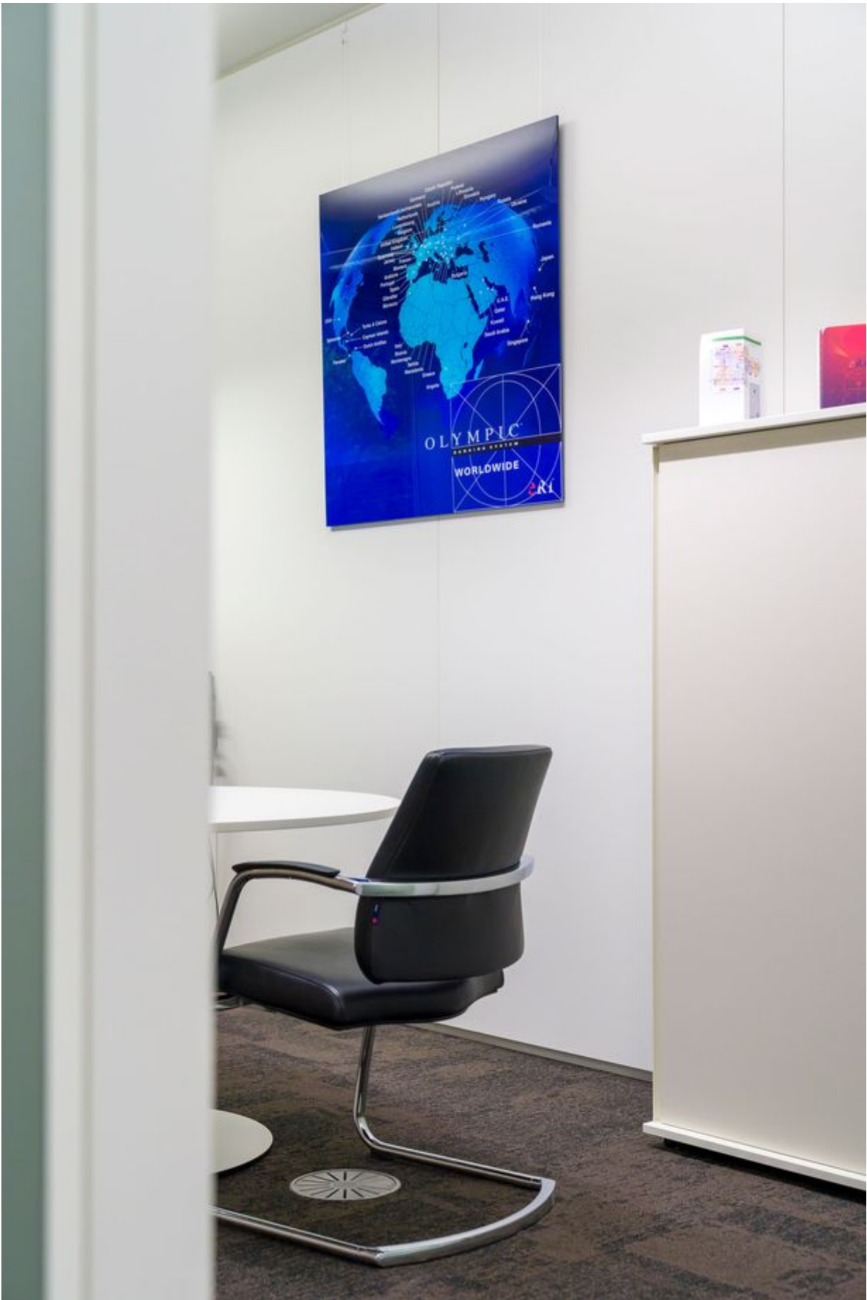
More than 300 financial service providers in over 50 countries have selected the OLYMPIC Banking System ...