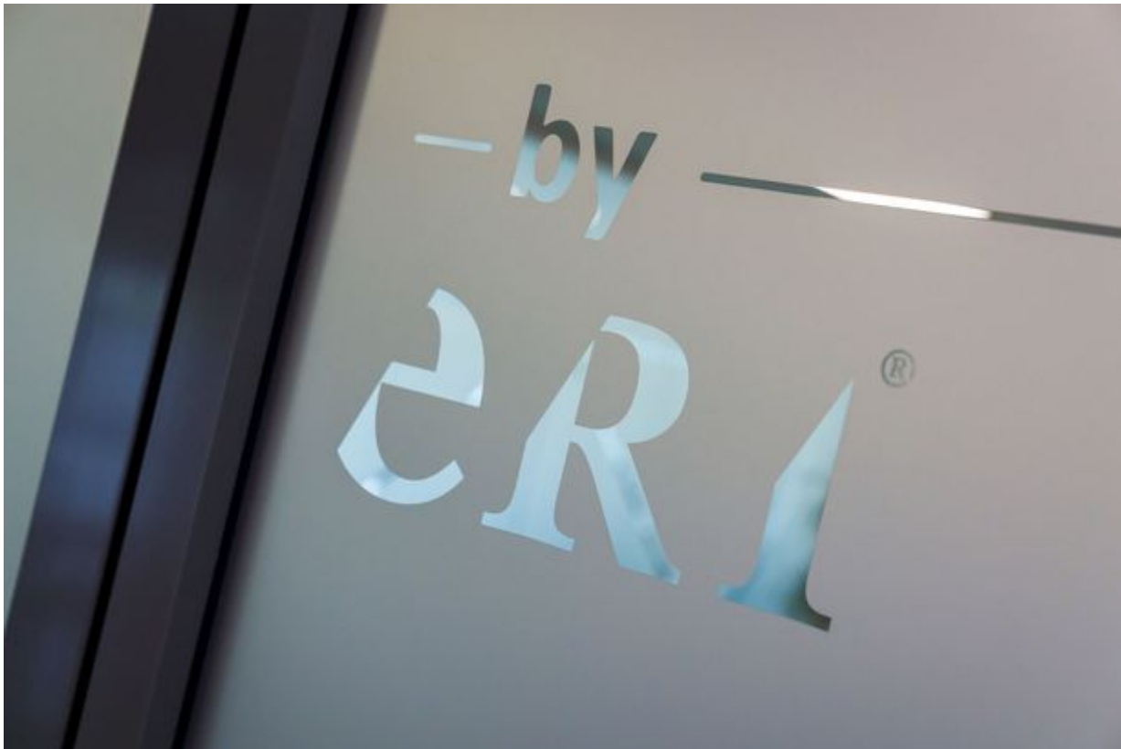
ERI Bancaire Luxembourg, an international company, specialises in the design, development, implementation and support of the leading, open, integrated, real-time software package for financial services providers: the OLYMPIC Banking System